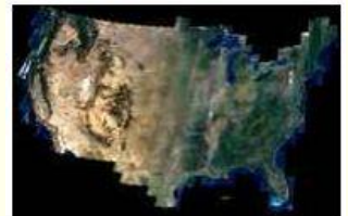
July 1 - 7 2008